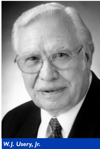
W.J. Usery, Jr.