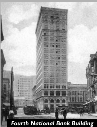
Fourth National Bank Building