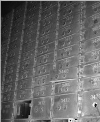
Basement safe deposit boxes

The Fourth National Bank opened this building on the corner of Marietta and Peachtree streets in the early 1900s. Several floors were added in 1928. In 1966 the bank built a 41-story tower adjacent to its home, reducing the height of the original building by half and resurfacing it in the white marble that covers it today. Architect: Cecil A. Alexander