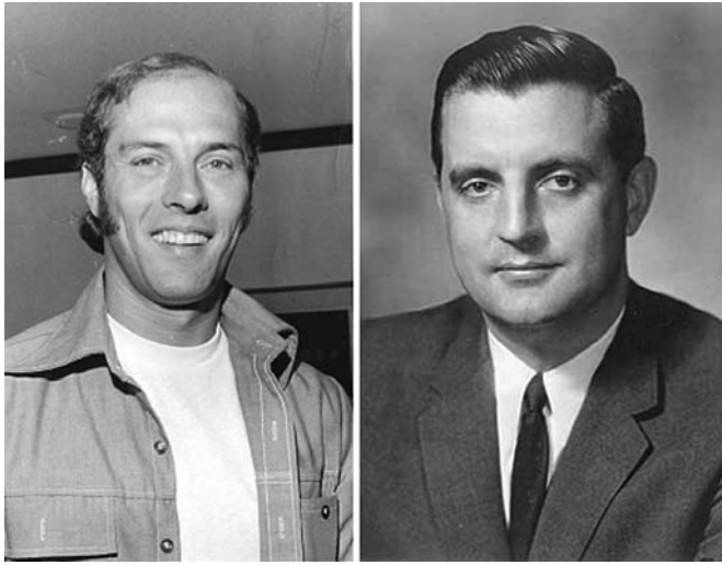
FIGURE 1. Henry Levin and Senator Walter Mondale, c. 1972.

that tells us just what educational neglect will cost us, and how much we need to spend to prevent it.”