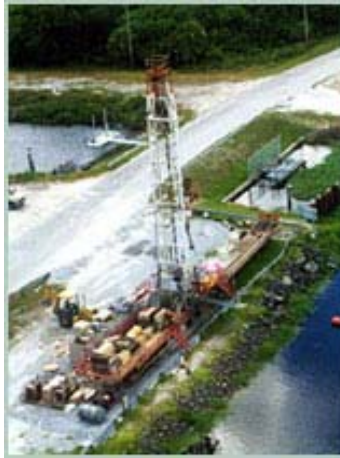
Figure 1 An ASR Well In Florida's Project (CFPR)