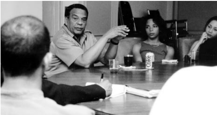
THE NEXT GENERATION: Former U.N. Ambassador Andrew Young, public affairs professor of policy studies, discusses his life's work with the Andrew Young School's summer policy interns. Undergraduate interns from throughout the United States and other countries join the school each summer to work with faculty members on research projects.