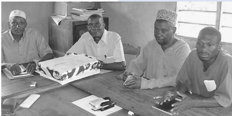
Council officials in Morogoro Rural District discuss capital development priorities for their village.